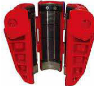
Drill Collar Slips