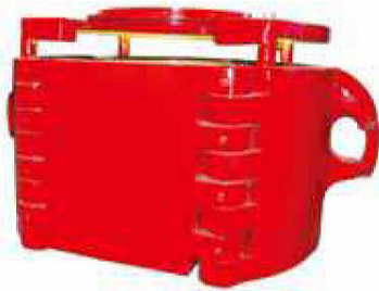
Pneumatic Casing Elevator/Spider

We supply a complete line of pipe handling tools for drilling and workover operations. Our product line includes hydraulic power tongs - drill pipe tongs and casing tongs, manual tongs, pneumatic casing elevator/spiders, elevators, elevator links, slips, safety clamps, master bushings and insert bowels, and roller kelly bushings, etc.