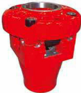
Roller Kelly Bushing